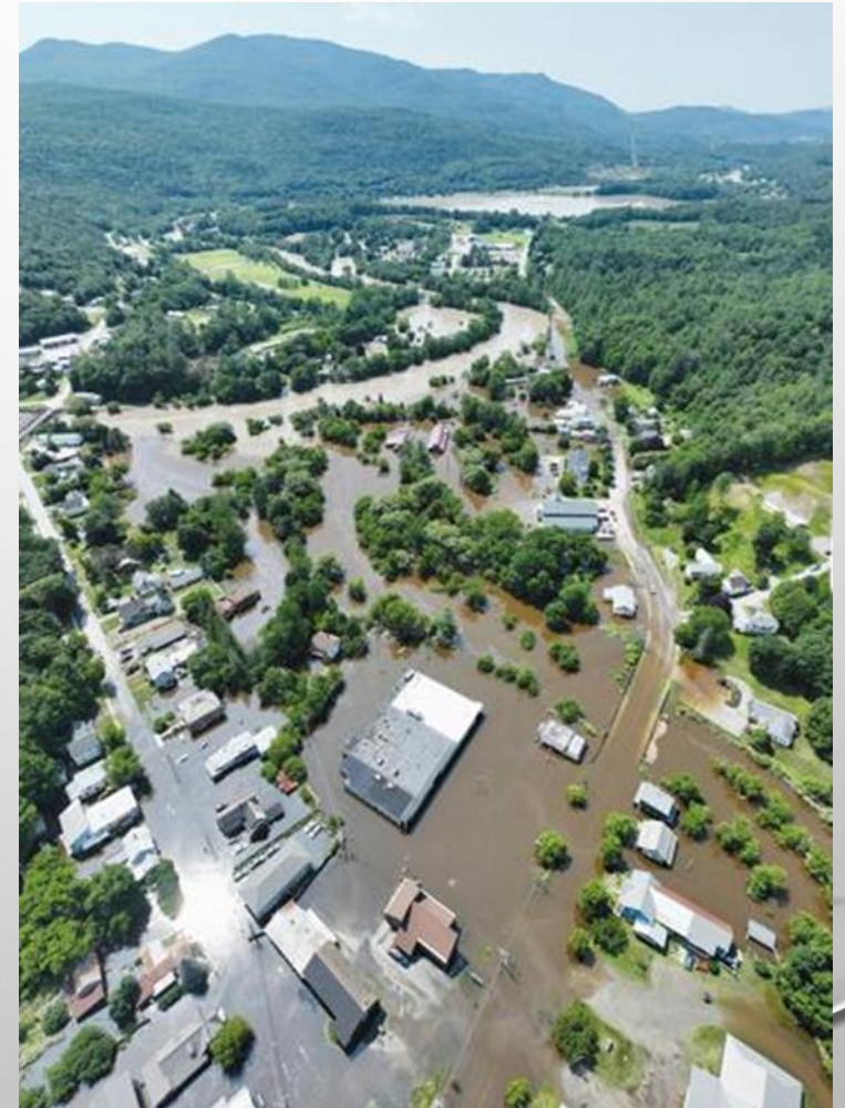
July 2023 Flood, Johnson Village