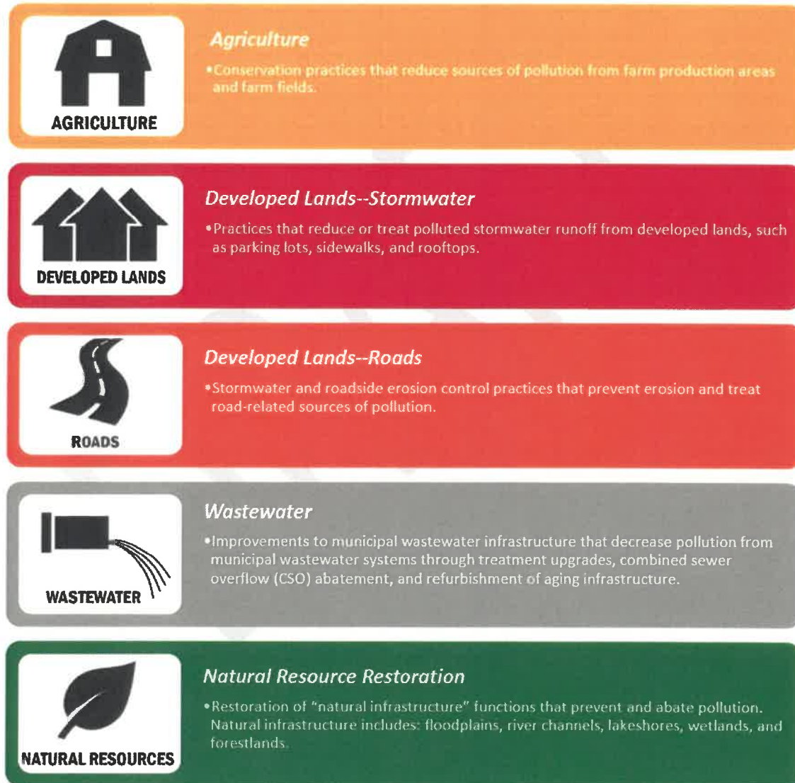
Figure 15. An illustration of the land use sector framework and practices used in Tactical Basin Planning to enhance, maintain, protect, and restore water quality.

In addition to this Tactical Basin Planning framework, the 2021 Lamoille River Watershed Tactical Basin Plan outlines implementation strategies by land use sector referenced in Chapter 5 “The Basin 7 Implementation Table.” See below examples of implementation strategies in conformance with the three primary objectives of the 2015-2023 Lamoille County Regional Plan :